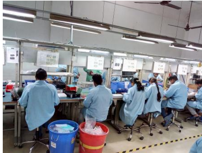
ECU Assy. and Function Checking 1