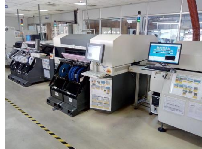
Pick and Place 2