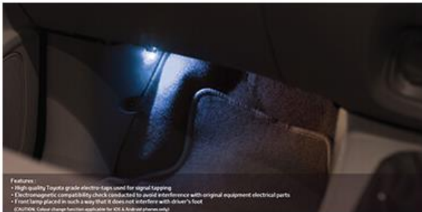
LEG ROOM LAMP (APP BASED)