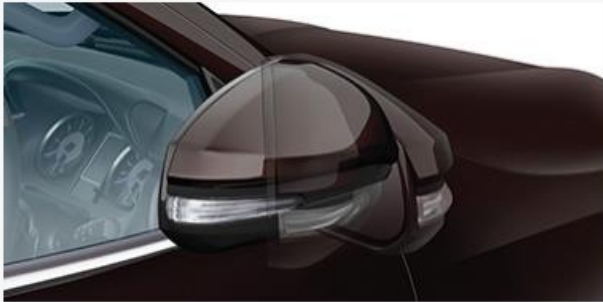
AUTO FOLDING MIRROR