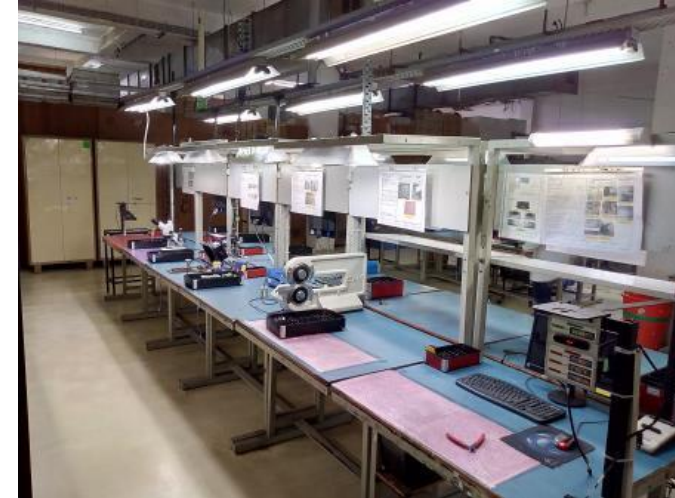
ECU Assy. and Function Checking 2

Production Capacity : 2500 Nos. Units Per Day