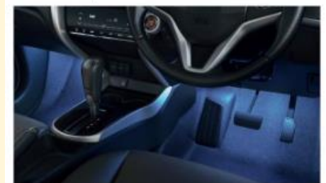
Leg Room Lamp