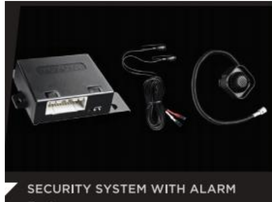
SECURITY SYSTEM WITH ALARM