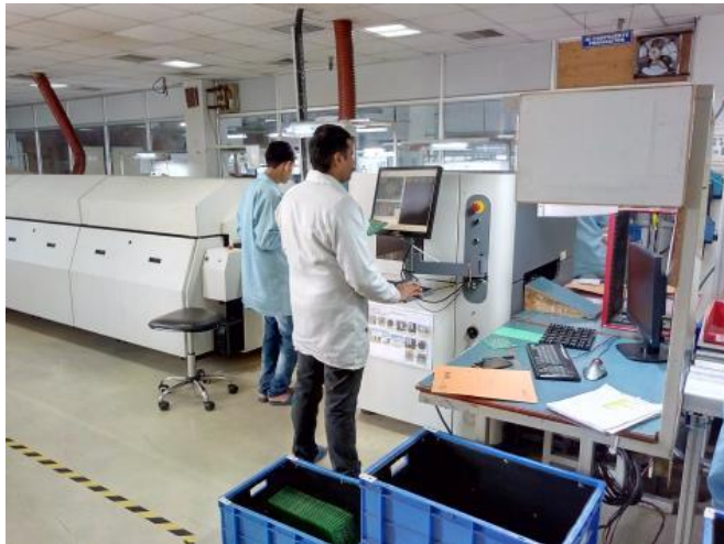
Automated Optics Inspection