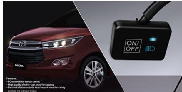
AUTO HEAD LAMP