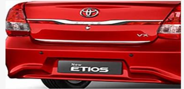
REVERSE PARKING SENSOR (BLACK)