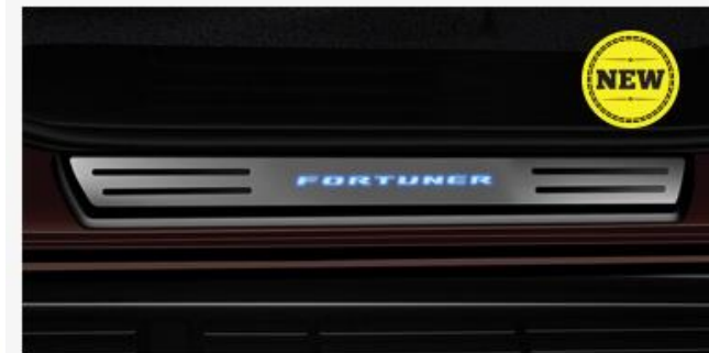
ILLUMINATED SCUFF PLATE