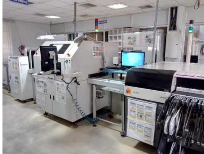
Pick and Place 1