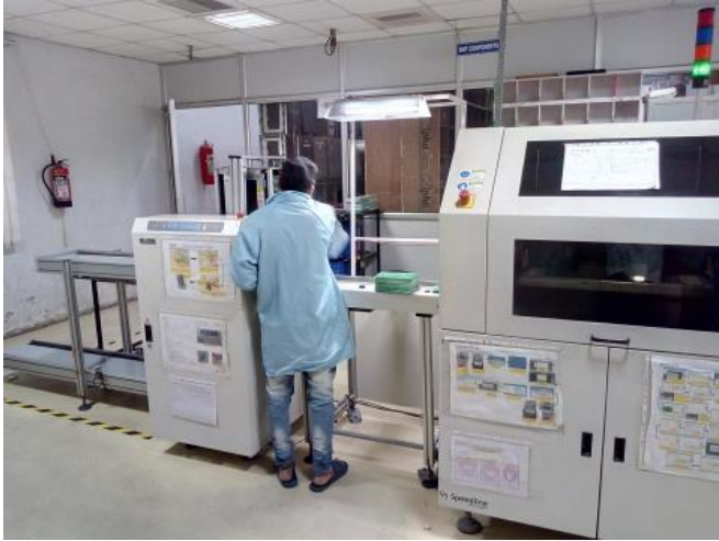
PCB Loader, Paste printing