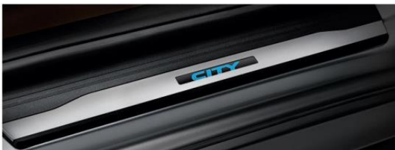
Step Illumination (All Four Doors)